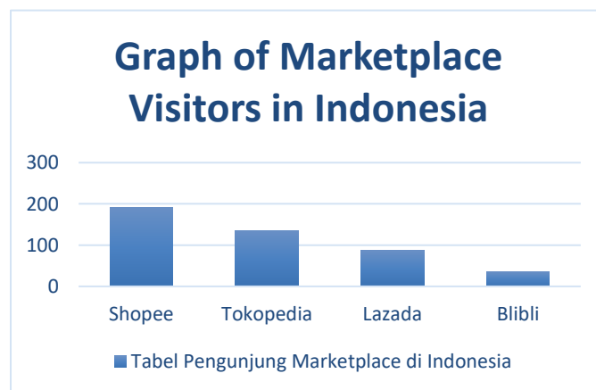
Graph 1. Marketplace Visitors in Indonesia

If we look at the point that currently Indonesian society uses a pattern of consumerism (Santoso, 2006) Where this pattern spends a lot on things that are more towards wants rather than on needs that can actually be used. Looking at the data in 2022, the largest marketplaces used by Indonesians are: